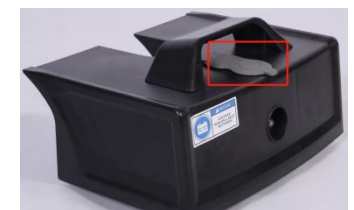
3-pin charger socket